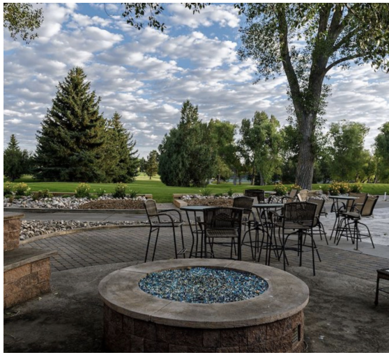
Cheyenne Country Club